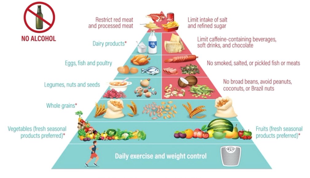
*Exclude or limit in presence of gastrointestinal symptoms